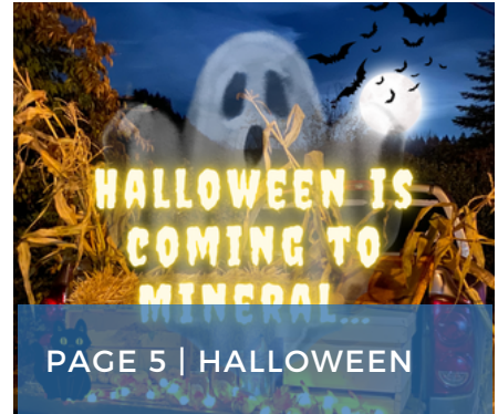
PAGE 5 | HALLOWEEN