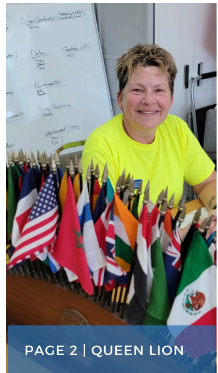
PAGE 2 | QUEEN LION