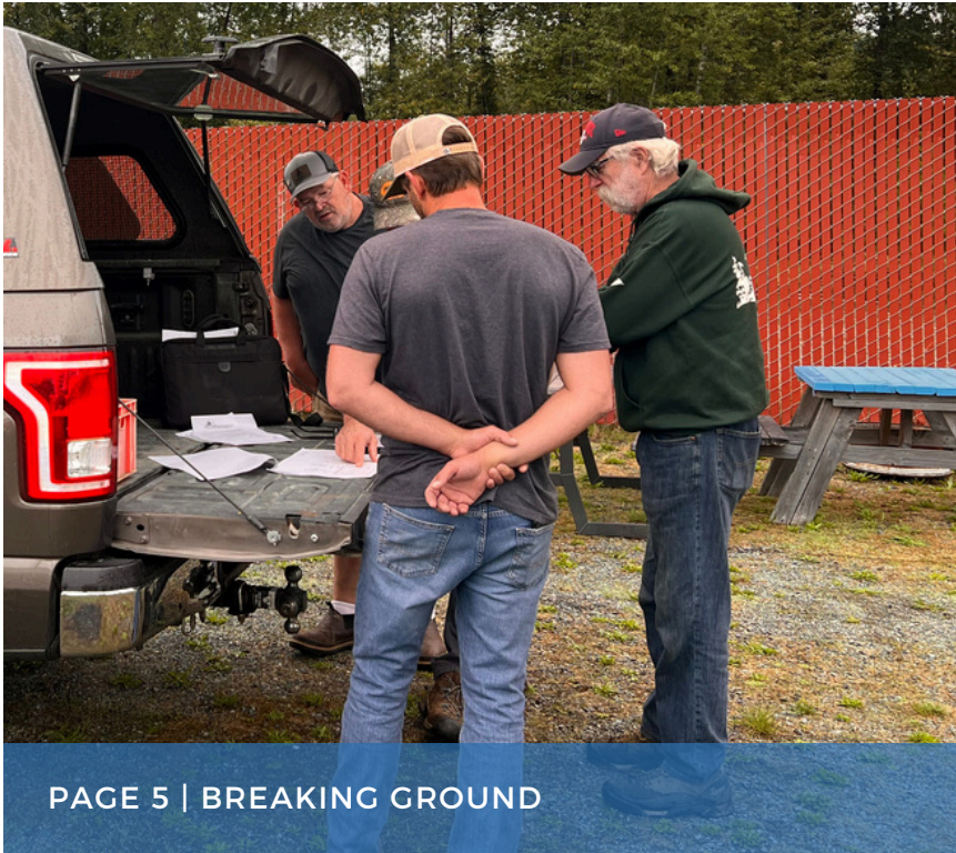
PAGE 5 | BREAKING GROUND