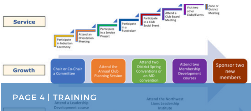
PAGE 4 | TRAINING